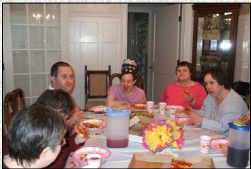
Birthday Parties !