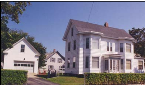
School Street - Sanford