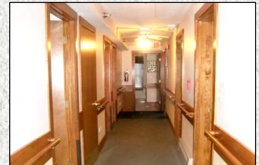
Extra wide hallways with hand rails

These homes feature extra wide halls, doorways, Hoyer lifts, ramps where needed, specialized tubs, walk-in/roll-in showers, and spacious rooms allowing full accessibility of the entire facility to our consumers.