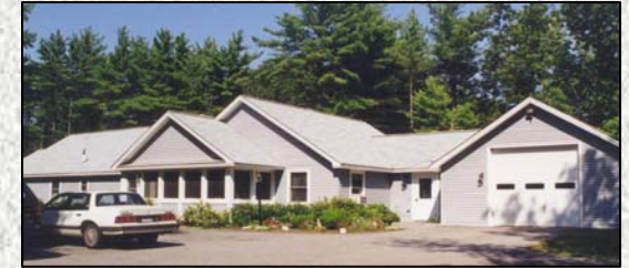
Morrells Mill - North Berwick