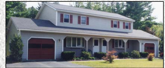
Old Mill Road - Sanford