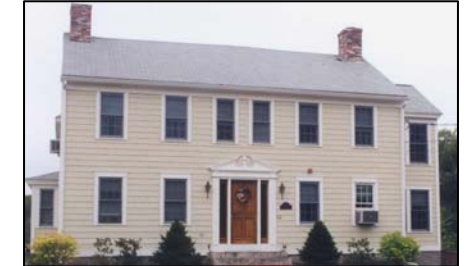
Day Street Home/Apartments - Kennebunk