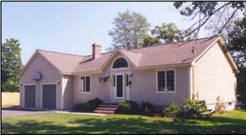
Lenox Street - Sanford