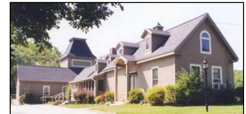
Windmill Farm - Springvale