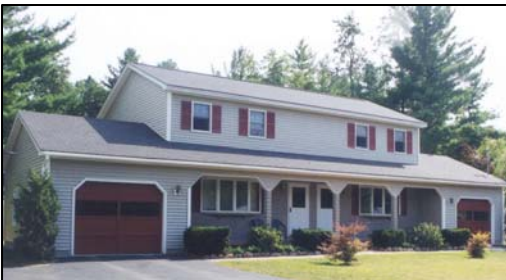
Old Mill Road - Sanford