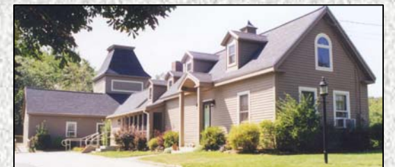
Windmill Farm - Springvale