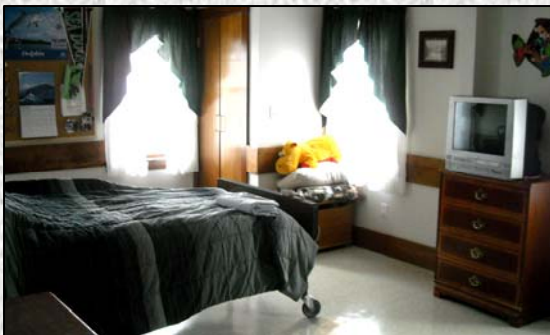
Personalized and private bedrooms