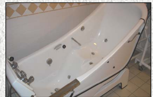
Customized spaces for accessibility